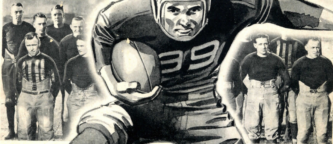
1920 STALEY TEAM

Honoring the 50 th ANNIVERSARY of the A. E. STALEY MFG. CO. Founder and Original Sponsor of the CHICAGO BEARS