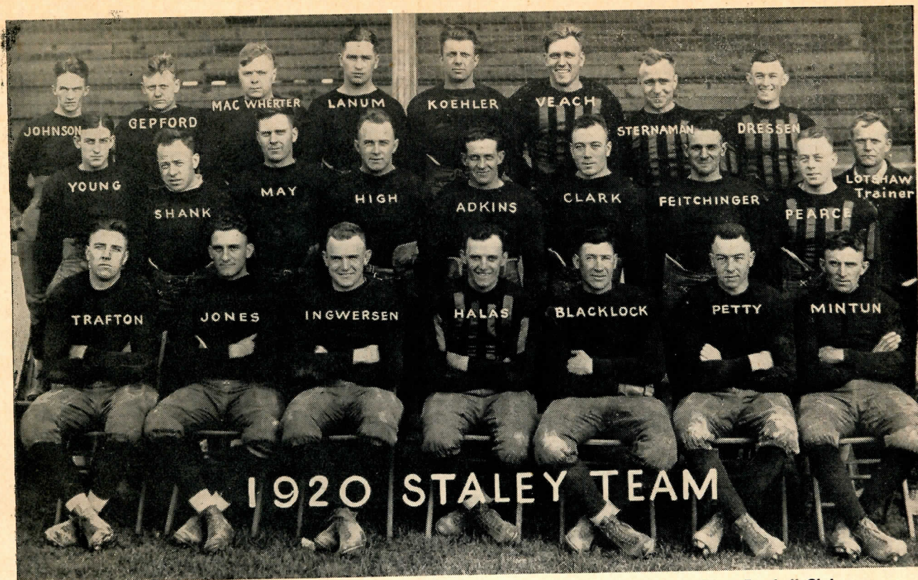
1920 DECATUR STALEYS SQUAD PICTURE — Forerunners of the Chicago Bears Football Club