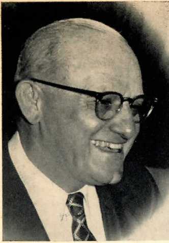
GEORGE S. HALAS